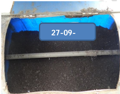
80 th day of Segregated drum compost