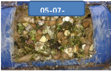
Segregated drum compost