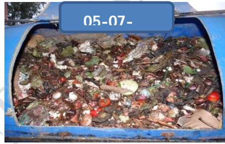
Unsegregated drum compost