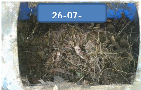
20 th day of Segregated drum compost