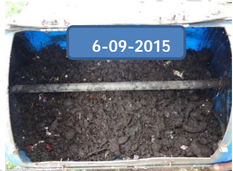
60 th day of Unsegregated drum compost