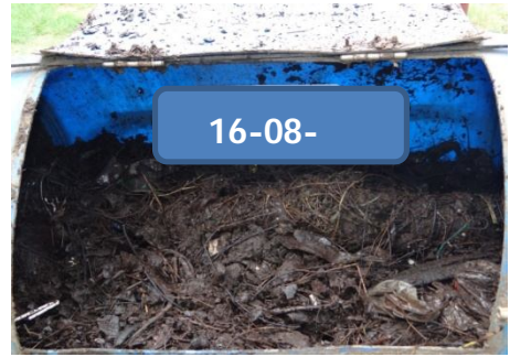
40 th day of Unsegregated drum compost