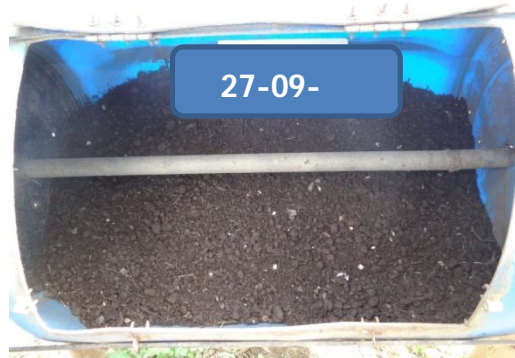
80 th day of Unsegregated drum compost