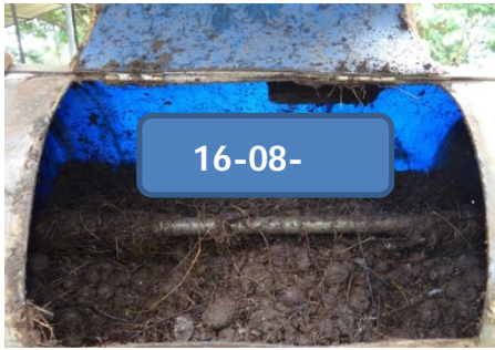
40 th day of Segregated drum compost