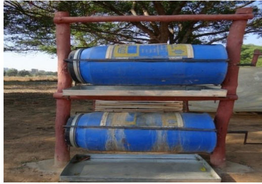
UAS (B) Drum Composter