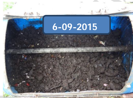
60 th day of Unsegregated drum compost