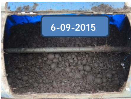
60 th day of Segregated drum compost