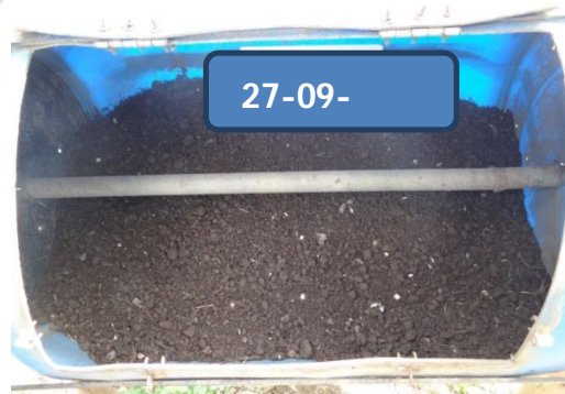
80 th day of Unsegregated drum compost