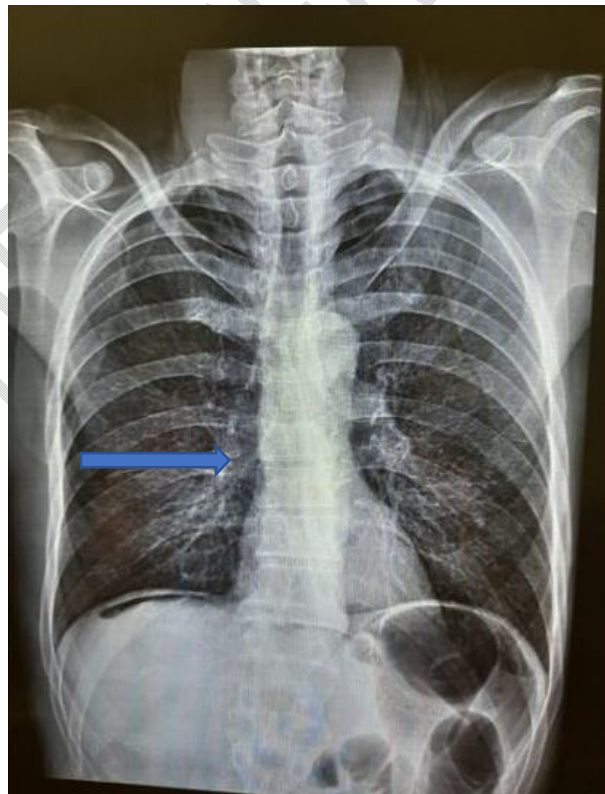
Figure 1 : The chest X-ray showing pneumoperitoneum

The chest X-ray showed pneumoperitoneum.