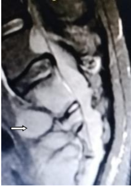
Fig 3 is a sagittal STIR sequence image showing the lesions is originating from L4 vertebral body and terminates at the coccyx and is hyperintense (arrow).

DISCUSSION: Neurofibromatosis of the spine, (SNF) could be described as a disease entity in which bilateral neurofibromas in spinal nerves and or in spinal roots are the central clinical presentation of the patients. However the classical symptoms and signs of NF1 (change in muscle tone, skeletal dysplasia etc) occur less frequently in these patients. Consequently only a minority of SNF cases satisfy completely the NF1 diagnostic criteria 16 . Skin fibromas are more common with NF1 than with SNF, despite extensive involvement of enlarged nerves involving the spinal nerves and roots.