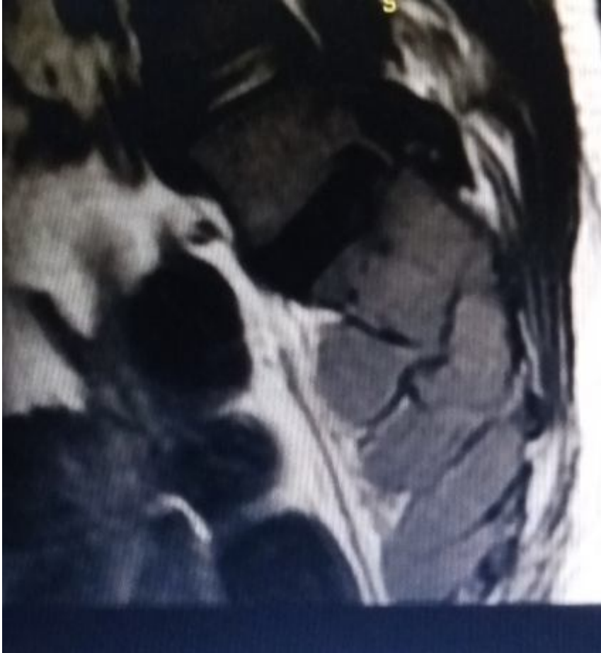
Fig 1 is a sagittal T1W sequence image of the lower lumbar to sacrococcygeal region of the spine with the lesions seen overlying it with dumb bell like shape that is slightly hyperintense to muscle.