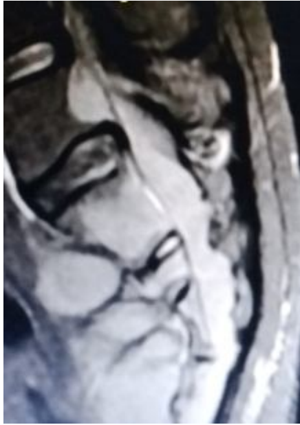
Fig 3 is a sagittal STIR sequence image showing the lesions is originating from L4 vertebral body and terminates at the coccyx and is hyperintense.

DISCUSSION: Spinal neurofibromatosis ( SNF) could be described as a clinical entity in which bilateral neurofibromas in spinal nerves and or spinal roots are the main clinical presentation of the patients however they present with less frequent manifestations of other NF1 features likechange in muscle tone, skeletal dysplasia etc. Infact only a minority of SNF cases satisfy completely the NF1 diagnostic criteria 16 . Dermal fibromas are more common in NF1 than in SNF, despite extensive involvement of enlarged peripheral nerves involving the spinal nerves and roots.