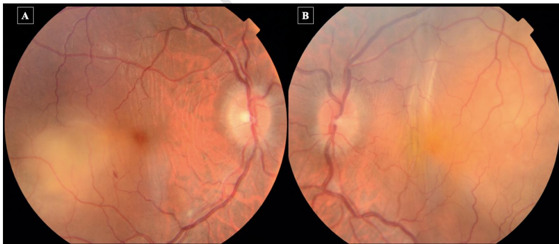
Figure 1: Color fundus photograph showing:

A: in the right eye, a yellowish protruding, subretinal, inferior temporal paramacular formation with blurred contours (evoking a Bouchut's tuberculoma), measuring a papillary diameter, with chorioretinal folds, small flame hemorrhage, and a blurring of the papillary edges.