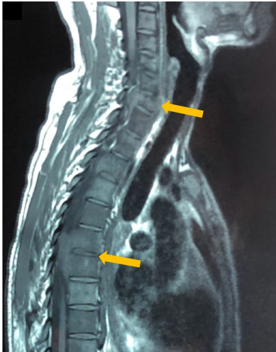
Figure 4: Spinal magnetic resonance imaging (MRI) suggesting a multifocal (cervical and lumbar) spondylodiscitis.