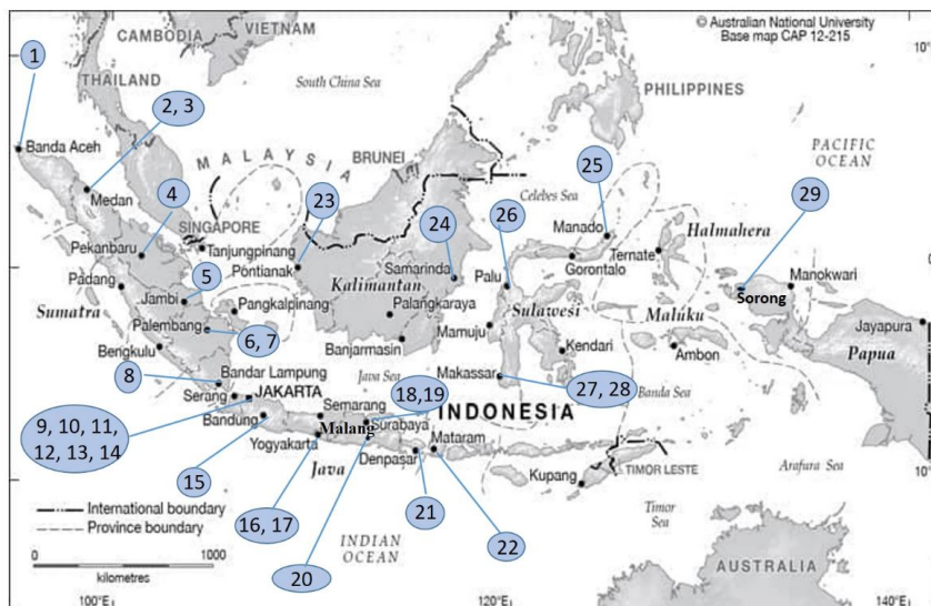
Fig. 3. Map of Indonesia with additional numbers that represent articles in table 1. Those studies were conducted in 19 big cities located in 18 provinces which have faculty of Medicine, some city even have more than one faculty of Medicine. Actually, there are 34 provinces in Indonesia and only 3 provinces (Bangka Belitung, North Kalimantan and West Sulawesi) that do not have any medical school program on their own province.

Figure 3 showed us, that out of 29 publications obtained from the internet, their distribution across Indonesia already sufficiently distributed. Although actually there are still several big cities in Indonesia that have faculties of medicine, state and private, but unfortunately their data is not found on the internet. That could possibly happen because: (1) the search keywords are not sufficient, (2) the data is locked/access is very limited or even (3) data was not uploaded to the internet.