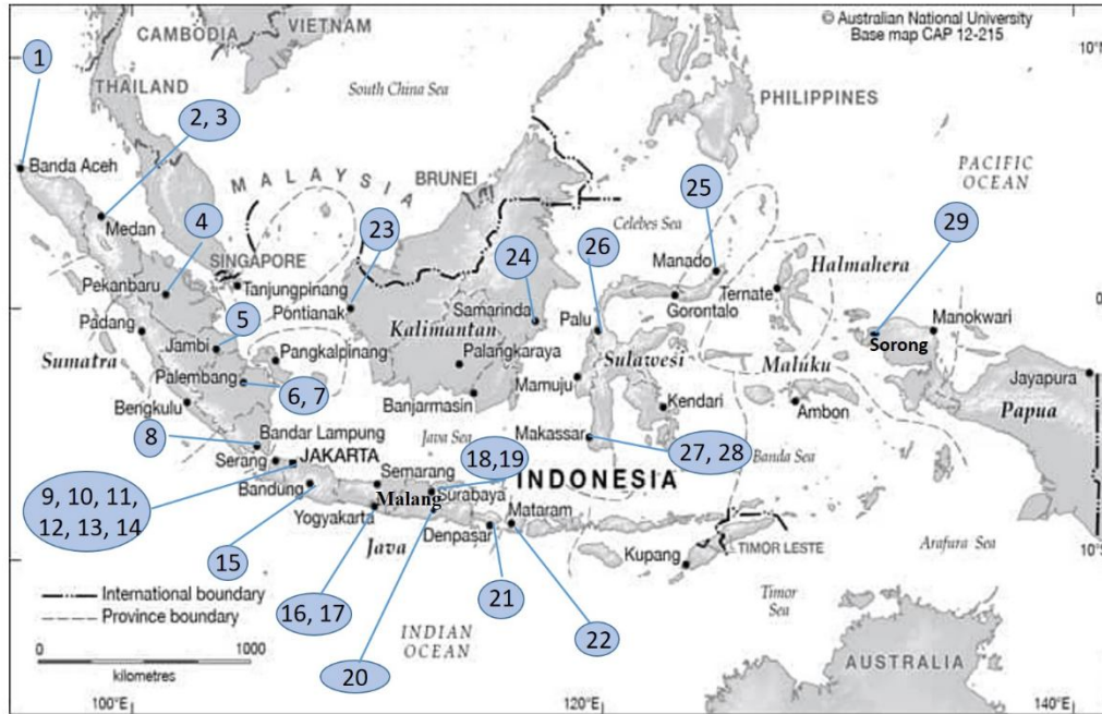
Fig. 3. Map of Indonesia with additional numbers that represent articles in table 1. Those studies were conducted in 19 big cities located in 18 provinces which have faculty of Medicine, some city even have more than one faculty of Medicine. Actually, there are 34 provinces in Indonesia and only 3 provinces (Bangka Belitung, North Kalimantan and West Sulawesi) that do not have any medical school program on their own province.

Figure 3 showed us, that out of 29 publications obtained from the internet, their distribution across Indonesia already sufficiently distributed. Although actually there are still several big cities in Indonesia that have faculties of medicine, state and private, but unfortunately their data is not found on the internet. That could possibly happen because: (1) the search keywords are not sufficient, (2) the data is locked/access is very limited or even (3) data was not uploaded to the internet.