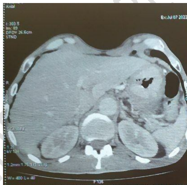
Fig. 1: Axial slides of abdominal CT scan a pneumoperitoneum

On the cerebral level, there is minimal meningeal haemorrhage from the brain scythe and cerebellum tent.