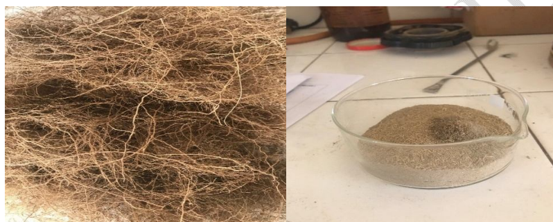
Figure 2: Dry and crushed roots of C. nigritanus .

The roots of C. nigritanus were collected in Thiès, more precisely in Nguint (latitude: 14.8035° north and longitude: 16.92586° west). They were dried at the Organic Chemistry and Therapeutics Research Team (ECOT) in Ngoundiane. After drying in the absence of sunlight, the roots were ground and recovered in powder form.