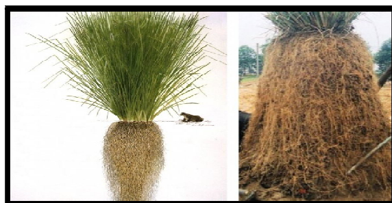
Figure 1: Representation of C. nigrifolius plant.

C. nigrifolius is a large, erect perennial herb in caespitose clumps, entirely glabrous, reaching 3 m in height. The leaves are rough, linear, tip-terminated, often folded, with scabrous margins. The sheath is compressed, carinated, the ligule reduced to a line of hairs. The inflorescence is a large pyramidal panicle composed of numerous purple racemes arranged in whorls. The spikelets are paired, one sessile, hermaphrodite, the other pedicellate and only male [2].