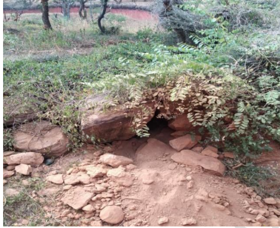
Original Den (Fig-2)