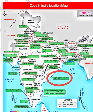
Map 1 : Map showing study location