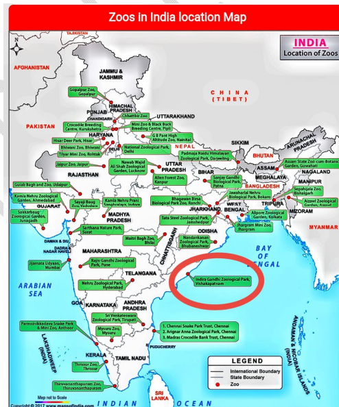
Map 1 : Map showing study location