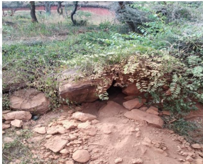
Original Den (Fig-2)