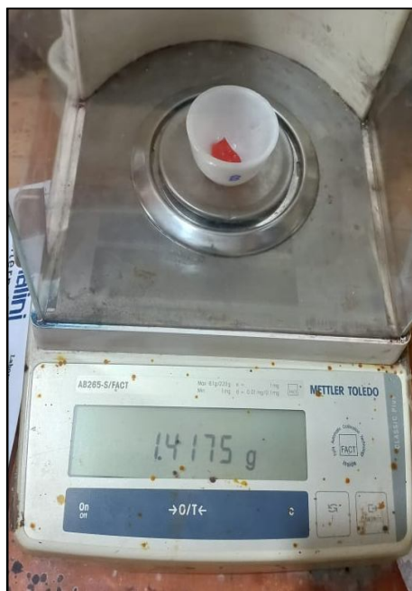
Figure 1 : Dentifrice dispensed in a teflon crucible and measured on a digital meter

Each toothpaste sample after measuring was dispensed in separate crucibles labeled with alphabets and digested with 5 ml of concentrated Hydrochloric acid (HCl) at moderated temperature. All the crucibles were placed on a hot plate in a fume cupboard (Figure 2), for heating for 3–4 h, after which 5 ml of HCl was added again and heated till fuming seized.