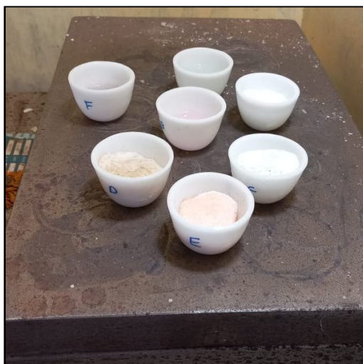
Figure 2 : Crucibles with dentifrice placed on a hot plate

The Teflon crucible was then cooled and rinsed. Distilled water was mixed to the existing dentifrice mixture and was made up to 100 ml in separate beakers. To these 10 ml of SPANDS-Zirconyl acid reagent mixture was added.