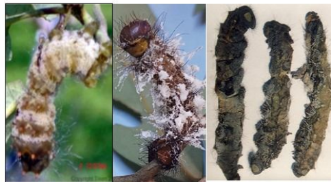
Fig: Muscardine disease of muga silkworm