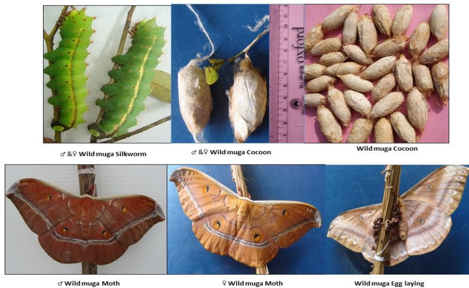
Figure 1: Wild Muga larvae, cocoon, moth and eggs