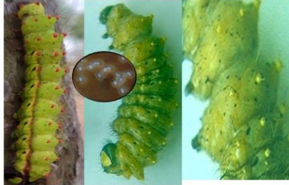
Fig: Pebrine disease of muga silkworm & pebrine spore