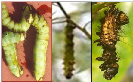
Fig: Grasserie disease of muga silkworm