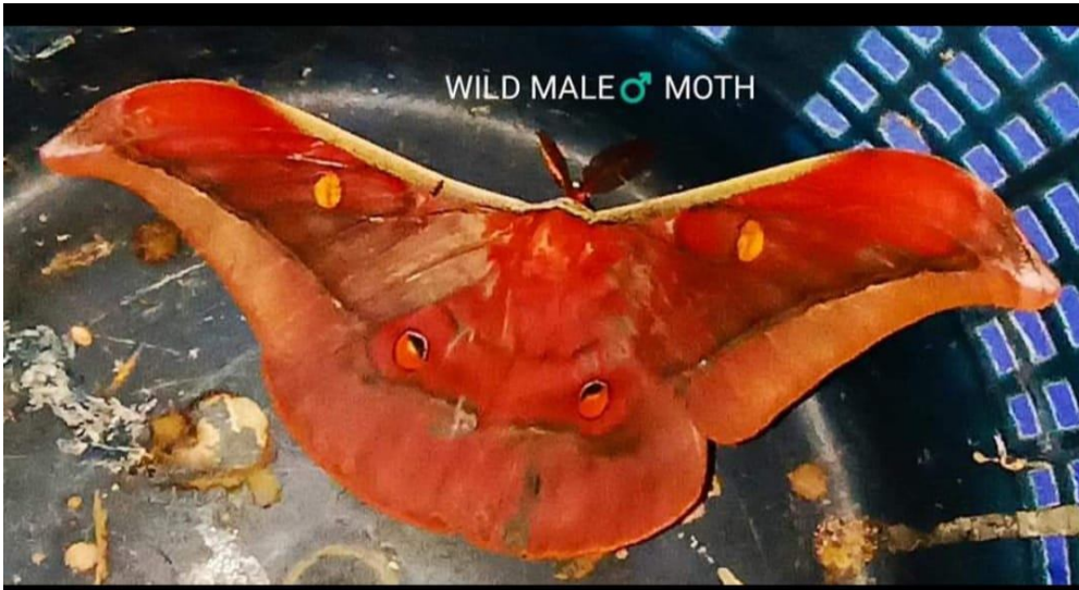
Fig.5 Wild male moth