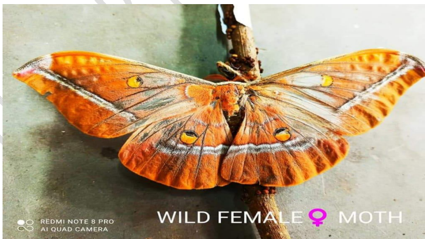
Fig.4 Wild female moth