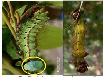
Fig: Flacheire disease of muga silkworm