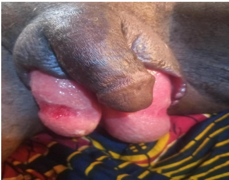
Fig 4: Clean wound with adequate granulation tissue

A 67-year-old male farmer, a known diabetic on irregular treatment, living in a very remote part of Rivers state, Nigeria reported to the hospital with complaints of swelling, pain, and foul smelling discharge from the scrotum of 5 days duration. On examination, he was confused, acutely ill-looking, pale, anicteric, febrile (Temp. 38.5°C) and moderately dehydrated. His pulse rate was 118 b/min, blood pressure was 130/80 mm Hg and respiratory rate 27 cycle/min. Systemic examination revealed no clinical abnormality but for his scrotum which showed gross edema with multiple discharging gangrenous patches, tender, with palpable crepitations all over. He was commenced on analgesic and antipyretic, intravenous fluid (Ringers lactate), intravenous ceftriazone along with metronidazole, and blood samples taken for investigations. A Foley's catheter was passed and retained, and 150 mL of concentrated urine was drained. Blood haemogram revealed PCV 27%, white cell count: 22.0 \times 10^9/L with neutrophilia (N-89%). Biochemical parameters were deranged (blood urea: 14.0 mmol/L, serum creatinine: 112.0 \mu\text{mol/L} , random blood sugar: 25 mmol/L, serum bilirubin: 25.8 \mu\text{mol/L} , AST: 65 IU/L, ALT: 60 IU/L). But the prothrombin time and serum electrolytes were within normal range. He was commenced on insulin injections for his high blood glucose and scheduled for emergency surgical debridement.