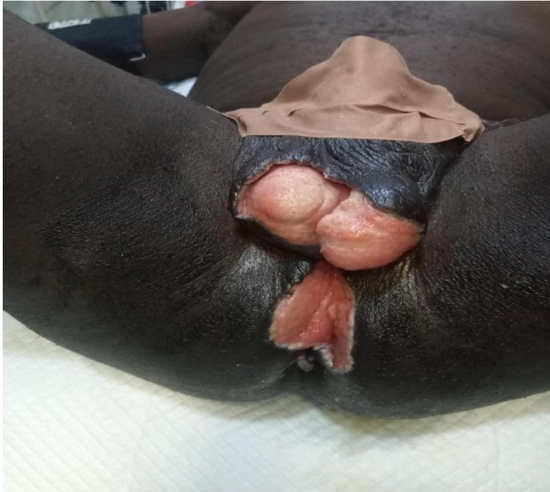
Fig. 3 Fournier's gangrene with adequate granulation tissue awaiting reconstruction

He was admitted and commenced on aggressive fluid administration, analgesic and antipyretic, and haemodynamic support. A urethral catheter was passed to monitor fluid input and output. Blood sample was taken for full blood count, fasting blood glucose and serology. The white blood cell count was 23.0 \times 10^9/L with neutrophilia (89.0%), fasting blood glucose was 5.6 mmol/L. With improvement in his haemodynamic status, he was taken to the theatre for surgical debridement under general anesthesia. Preoperative antibiotic treatment with ceftriaxone and metronidazole was initiated. Wound swab was taken for microscopy, culture and sensitivity. The necrotic skin in the scrotum and the perianal region was evacuated into a wide-open drainage area, without any damage to the testicles, spermatic cords, or external sphincter. The wound swab yielded Staphylococcus aureus and Escherichia coli which were sensitive to ceftriaxone and ceftazidime. Debridement was done three times with moist gauze dressing twice daily until healthy granulation tissue was observed. Subsequently, dry dressings were used. The infection gradually subsided, the gas gangrene resolved completely and good granulation tissue started appearing six weeks after the surgery. The different stages of the lesion are shown in figures 1, 2 and 3. Reconstruction with secondary suturing of the wound was done on the 37th postoperative day and the sutures