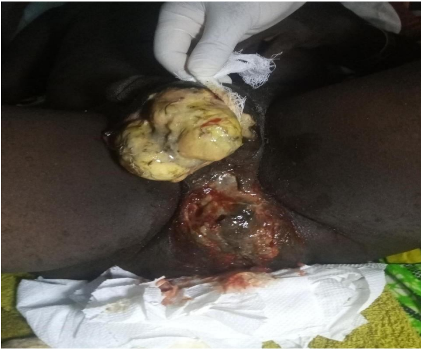
Fig. 2 Fournier's gangrene after the first debridement