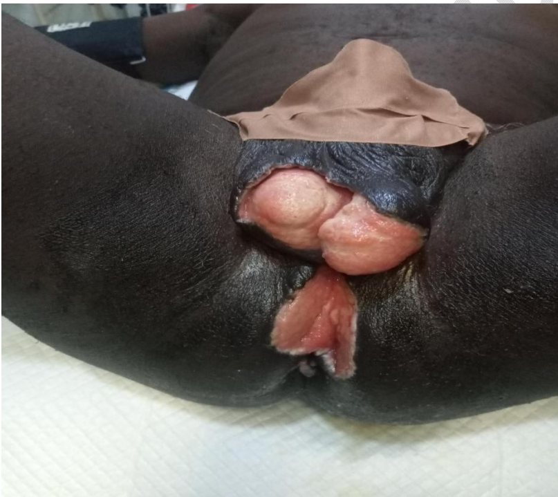
Fig. 3 Fournier's gangrene with adequate granulation tissue awaiting reconstruction

He was admitted and commenced on aggressive fluid administration, analgesic and antipyretic, and haemodynamic support. A urethral catheter was passed to monitor fluid input and output. Blood sample was taken for full blood count, fasting blood glucose