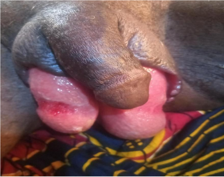
Fig 4: Clean wound with adequate granulation tissue

Wound swab was taken for microscopy, culture and sensitivity. Culture report showed E. coli and Staph. aureus sensitive to ceftriazone and ciprofloxacin hence the same antibiotic regimen was continued. His urine output became normal by the 2nd post-operative day. By the 5th post-operative day, his blood urea and serum creatinine came within normal range. The blood glucose level was well controlled with insulin therapy. Regular wet dressing was done along with topical application of povidone iodine and the wound was debrided two more times until healthy tissue became visible on the 57 th post operative day.