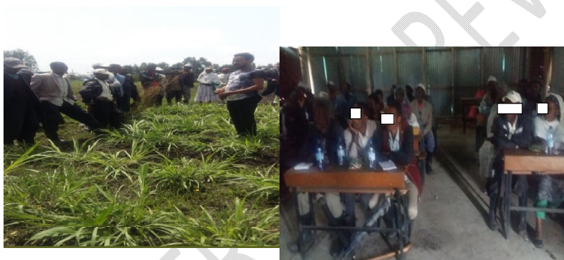
Figure 3: Photos of practical and theoretical training delivered at the vegetative stage of the plant.