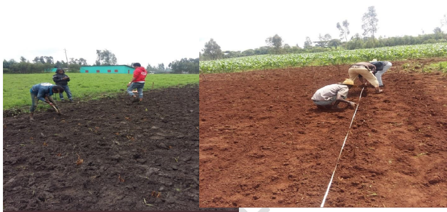
Figure 2. photos during Elephant grass planting operation inside FTCs

Elephant grass root splitting of (Accession # 14794 and local check) was used for this demonstration purpose because Accession # 14794 variety was adaptable in a tested environment when it was tested on a research station for adaption. Then, root splits of elephant grass were prepared in form of at least 0.5m-1m (in number 400 -500 root splits per FTC in a total of 2400-2500 root splits) and were planted on a plot size of (10m 2 * 20m 2 ) in respect to 0.5meters between plants and 1meter between rows on farmers training centers (see Figure 2) .