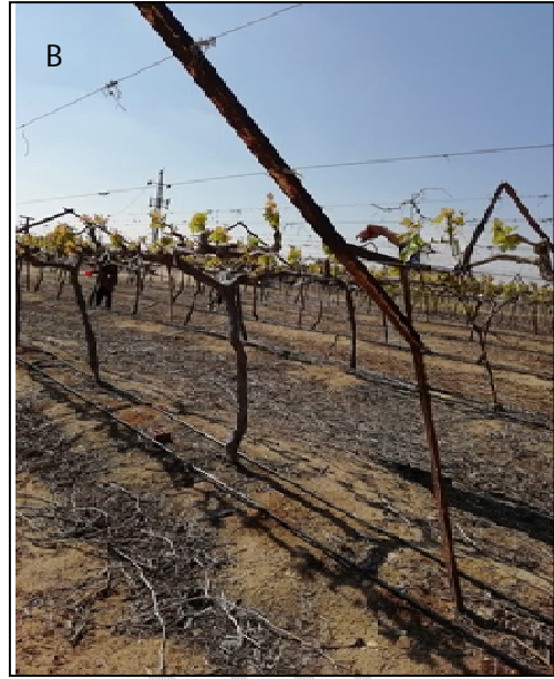
102 103 104 105 Fig.1.103 photograph ( A) of Flam Seedless vineyard ( V. vinifera , L) grown with Spanish Parron shape system and (B) before winter pruning