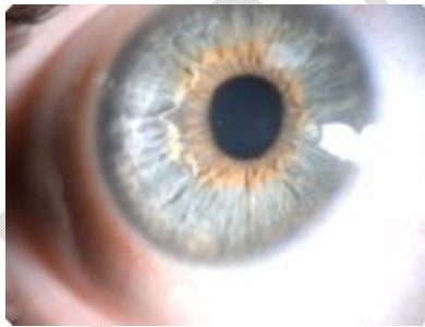
Figure 3 : favorable evolution under antibiotic therapy