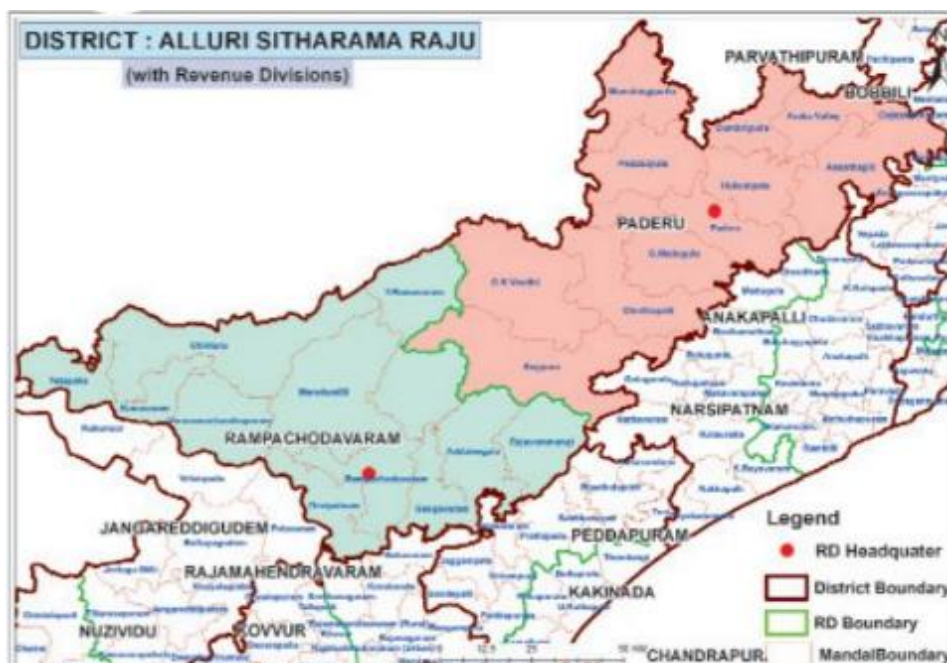
Fig. 1. Map showing study location

Fish tail palm is the main income source for rural area of agency belt in Alluri Setharma Raju district (formerly East Godavari district). The area of 12 sq.km area of 9 lakh people in 3000 villages having literacy of less than 50%. More than 70% of villages having fishtail population which will give regular income to tribal people.