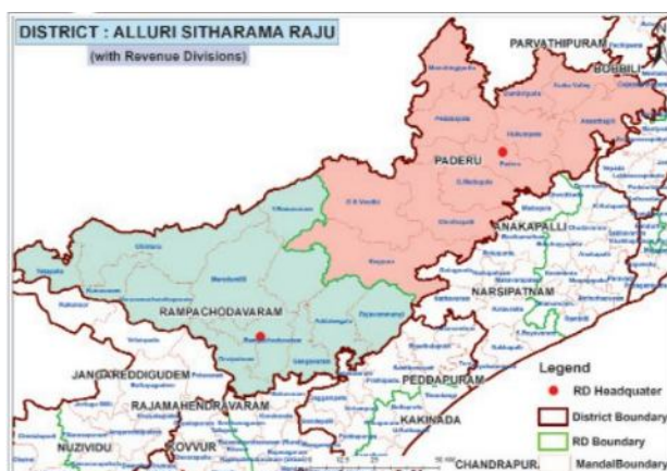
Fig.1 : Map showing study location

Fish tail palm is the main income source for rural area of agency belt in Alluri Setharaja Raju district (formerly East Godavari district). The area of 12 sq.km area of 9 lakh people in 3000 villages having literacy of less than 50%. More than 70% villages having fishtail population which will give regular income to tribal people.