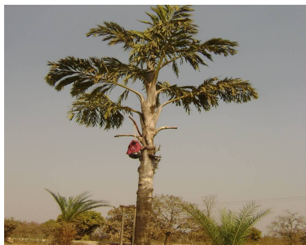
Fig.2 : Plant natural products use for the study

As it had many uses, and naturally available in specific areas, due to increase in demand for natural products i.e palm jaggery, palm sugar, palm wine etc, there is need of research on propagation for development of plant population and value added products to create value chain and entrepreneurship development in utilisation of fishtail palm or sago palm.