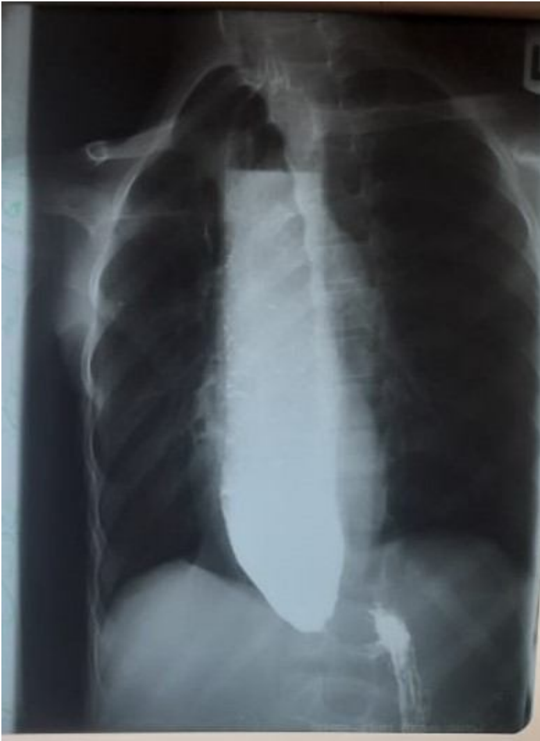
Figure 2: Barium swallows showing the tapering of the distal oesophagus - “a typical bird’s beak-like appearance”