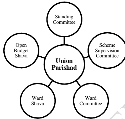
Figure 2 Existing mechanisms at Union Parishad to ensure social accountability.

Committee (SSC), and Standing Committee (SC) has been kept for empowering citizenry with monitoring and supervising power and making civic engagement more viable.