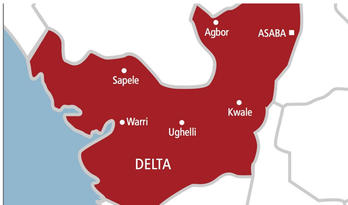
Figure 1: Map of Delta state showing the study area.

There are various solid mineral deposits within the state-industrial clay, silica, lignite, kaolin, tar sand, decorative rocks, limestone, etc. These are raw materials for industries such as bricks making, ceramics, bottle manufacturing, glass manufacturing, decorative stone cutting and quarrying. This has caused some environmental issues of which risk from radiation is paramount.