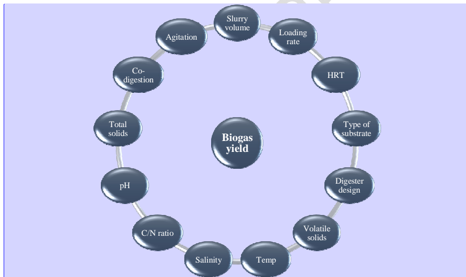
Fig. 1. Factors affecting biogas yield

The slurry volume of the substrate mainly plays a role in the overall value of the biogas potential. Smaller slurry volumes tend to have lower biogas potentials and vice versa. HRT depends largely on the slurry volume, temperature, percentage of total solids, organic loading rate, etc. Other factors that can affect biogas yields include the type of substrate, organic loading rate, digester design [55], salinity [56], and agitation [57]. Figure 1 shows the main factors affecting biogas yield.