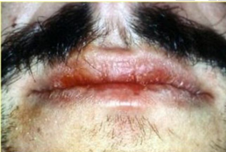
Figure 6. Angular Cheilitis in an HIV-positive homosexual.

- Cheilitis (Figure 6): Candida albicans lip infection is rare, and it includes a pattern of erosive lesions on an inflamed and enlarged lip. In any case, these candidiasis in HIV-positive subjects are often a sign of the development of AIDS.