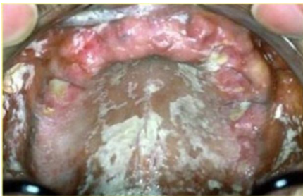
Figure 2: Diffuse pseudomembranous candidiasis of the palate and tongue.

-Pseudomembranous candidiasis or thrush (Figure 2): Clinically, this candidiasis is characterized by the presence of whitish or yellowish plaques on an erythematous mucosa. The whitish plaque can be removed by scraping to make way for a bloody surface. This type of candidiasis is most often observed in the palate, the labial and cheek mucous membranes, and the dorsal surface of the tongue.