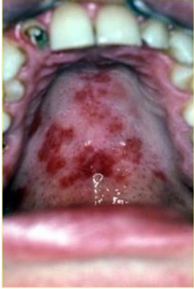
Figure 1: Acute erythematous candidiasis of the palate in an HIV-positive homosexual.

-Pseudomembranous candidiasis or thrush (Figure 2): Clinically, this candidiasis is characterized by the presence of whitish or yellowish plaques on an erythematous mucosa. The whitish plaque can be removed by scraping to make way for a bloody surface. This type of candidiasis is most often observed in the palate, the labial and cheek mucous membranes, and the dorsal surface of the tongue.