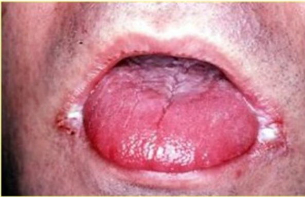
Figure 5: A unilateral Perleche.

the commissures in the form of a fan-shaped epidermal erosion. The folds of the commissure are marked, pinker, with a little damp [9]. Internal oral candidiasis makes the etiological diagnosis easy. Sometimes there is an extension of the lesion on the retro-commissural mucous surface of the cheek.