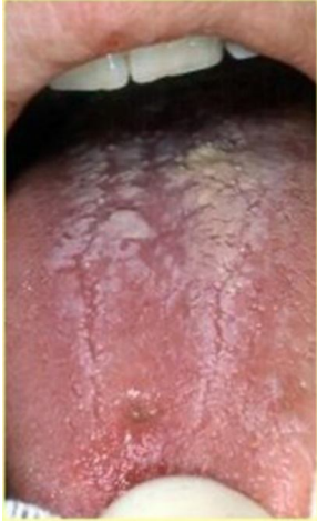
Figure 3: Hyperplastic candidiasis of the tongue in an HIV-positive drug addict.

-The black hairy tongue (Figure 4): In some situations, the tongue turns brown and then black. The associated papillary hypertrophy can reach several millimeters and give the appearance of a hairy or villous tongue. The black color is attributed to the oxidation of keratin.