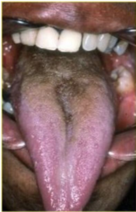
Figure 4: A black hairy tongue.

-The black hairy tongue (Figure 4): In some situations, the tongue turns brown and then black. The associated papillary hypertrophy can reach several millimeters and give the appearance of a hairy or villous tongue. The black color is attributed to the oxidation of keratin.