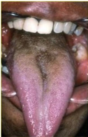
Figure 4: A black hairy tongue.

-The black hairy tongue (Figure 4): In some situations, the tongue turns brown and then black. The associated papillary hypertrophy can reach several millimeters and give the appearance of a hairy or villous tongue. The black color is attributed to the oxidation of keratin.