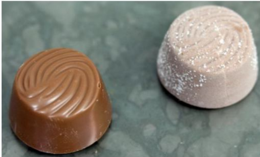
Fig 4. Freshly produced (left) and heavily fat bloomed chocolate pralines. Dahlenborg[60].