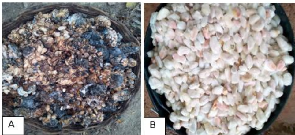
Fig 1. Fresh cocoa beans extracted from the damaged pods (A), Fresh cocoa beans extracted from healthy pods (B)

acidity, flavor precursors development sugars degeneration and protein degradation) and FFA levels in fermented cocoa [29]. High FFA content could result from diseased pods or due to lipases activities producing mold strain growth on the surface of cocoa beans and hydrolysis of cocoa butter. Fungal growth in cocoa beans is reported to be due to extended storage in poor conditions [30], prolonged fermentation, or inadequate drying process [31, 32] which confirm cocoa beans fermentation duration have a critical effect on the increase of the chances for FFA generation.