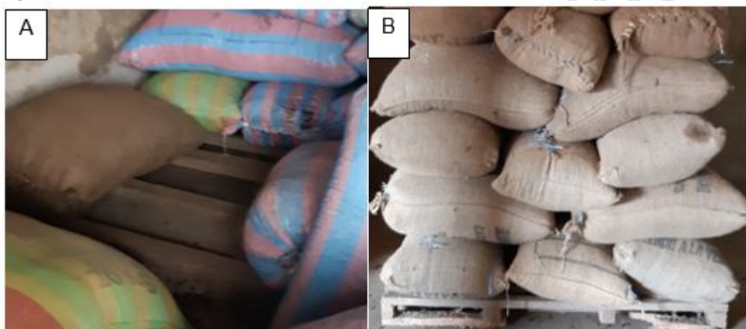
Fig. 2. Poor storage conditions of fermented and dried cocoa beans bags: polystyrene bag (A), Good storage conditions cocoa beans: jute bag (B)

dried cocoa beans resulted in penetration of molds in the cocoa pod and then in seeds. The significant increase in the FFA content during cocoa beans storage suggests that infestation and damage of insects could be considered as the main factors causing the occurrence of FFA in the cocoa butter. Several researches have reported that common storage insect pests of fermented and dried cocoa beans included Tribolium castaneum (Herbst), Cryptolestes ferrugineus (Stephens), E. cautella , Lasioderma serricornis and Araecerus fasciculatus [36, 37]. Jonfia-Essien and Navarro [38] highlighted the role of insects the hydrolysis of the triglycerides of cocoa butter leading to the formation of high FFA content in the fermented and dried cocoa beans stored in poor conditions. The increase in the concentration of FFA therefore has a direct impact on the fat content and causes negative changes in cocoa flavor [39]. It was why the EU regulation 2000/36/EC and Codex STAN (86-1981) limited the maximum FFA content to 1.75% oleic acid equivalent in cocoa butter. Strong increasing of FFA contents from 6.23 % to 11 % were observed in poor quality fermented and dried cocoa beans such as clustered beans. In addition to their pronounced influence on cocoa butter crystallization, high FFA content could result in a rancid off-flavor [40].