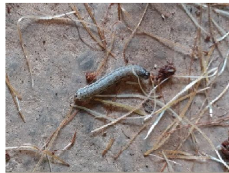
(b) Ulat Grayak ( Spodopterafrugiperda )