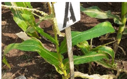
Figure 3. Symptoms of Nutrient Deficiency

Deficiency symptoms seen in corn plants are symptoms of nitrogen deficiency. This symptom is indicated by the yellowing of the leaves, forming a V shape (Figure 3). Symptoms of nitrogen deficiency were found in corn plants that were not given N, P, K, or biological fertilizers (control). A lack of nutrients in the soil causes deficiency symptoms. N nutrient deficiency can cause slow growth and stunted plants (Andita et al., 2019).