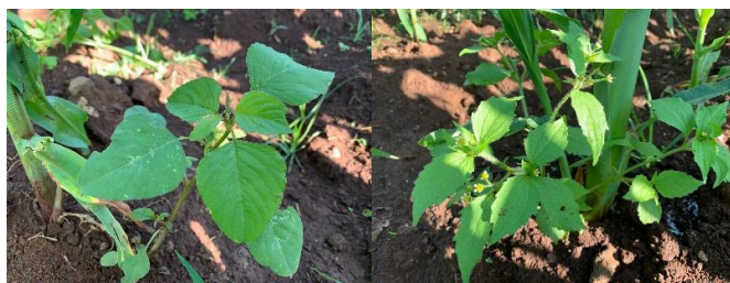
(a) Bayam Duri ( Amaranthus spinosus ) (b) Bribil ( Galinsoga parviflora ) Figure 2. Weeds on Sweet Corn Plants