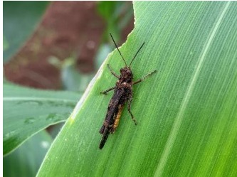
(a) Belalang ( Locustamigratoria )

The armyworm is a leaf-eating polyphagous pest and one of the main pests of sweet corn. Symptoms of armyworm attack found during the planting period of sweet corn were randomly perforated leaves. This pest can cause up to 85% damage to corn plants and even crop failure (Muliani et al., 2022). Control of this pest attack is done manually (technically) by taking caterpillars that are in the leaves and stems. This is because the attack intensity is <5%, so it is not too detrimental (Sofyan et al., 2019)