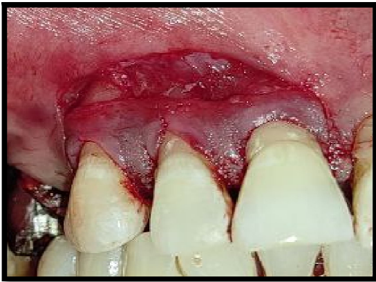
Fig.2. sulcular incision with slight divergent incisions were given