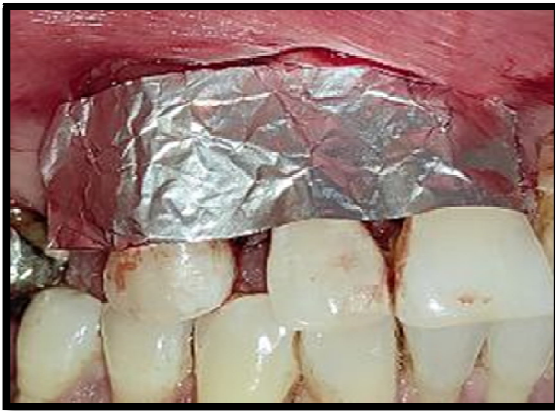
Fig.5. The fabricated PRF membrane was placed at the surgical site and flap was adapted at the CEJ and aluminum foil was placed for stabilization of the PRF membrane. followed by placement of periodontal dressing . No sutures were placed.

The Patients were given post operative instructions and were advised to avoid brushing in the operated area for the next 2 weeks. 0.2% chlorhexidine mouthwash and Zerodol tablets were prescribed twice daily for 1 week. The post surgical healing noticed was uneventful. Patient was recalled after 7 days for followup and for removal of periodontal dressing. The patient was then recalled after 21 days, 6weeks and after 3 months ( Figure. 6 and figure 7)