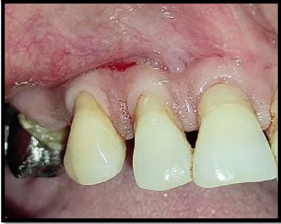
Fig.1. Anesthesia was given in the area to be operated