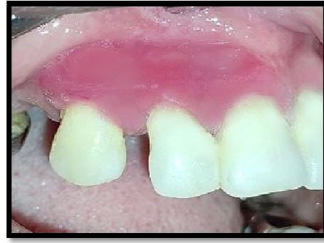
Fig.7. After 3 months