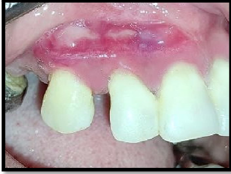
Fig.6. After 1 week