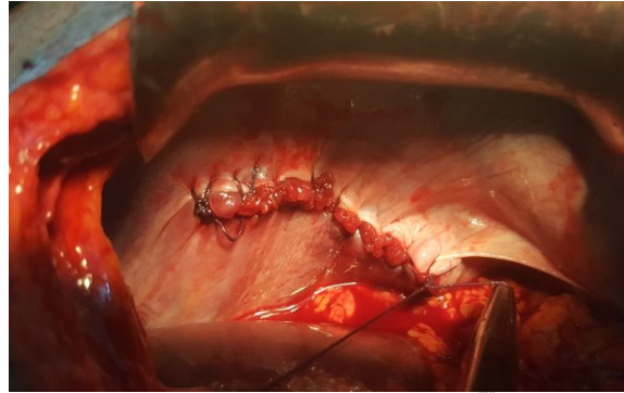
B. Left diaphragmatic tear suture