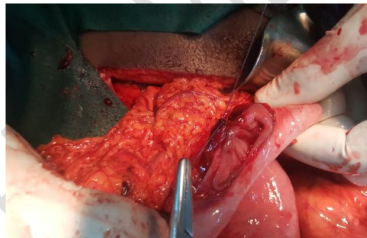
D. Resection-anastomosis of the ileal tear