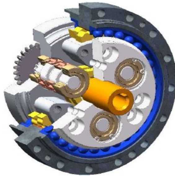
Fig. 1 schematic diagram of RV reducer