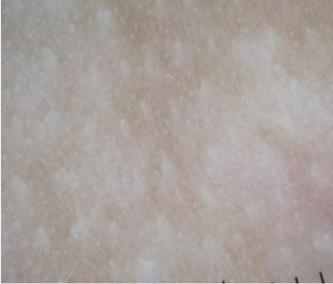
Figure 3: dermoscopy showed hypopigmented areas poorly limited without any particular pattern