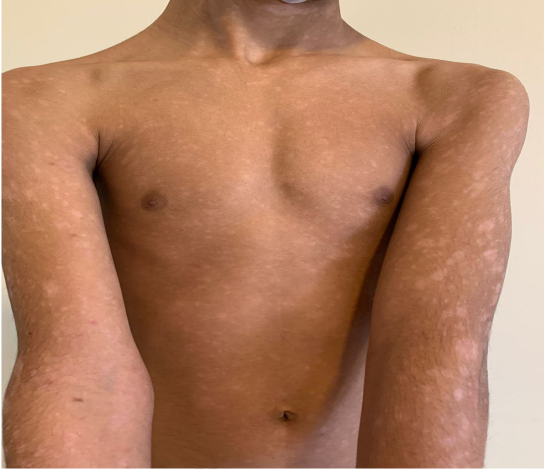
Figure 2: extension of the macular lesions at the trunk and the limbs