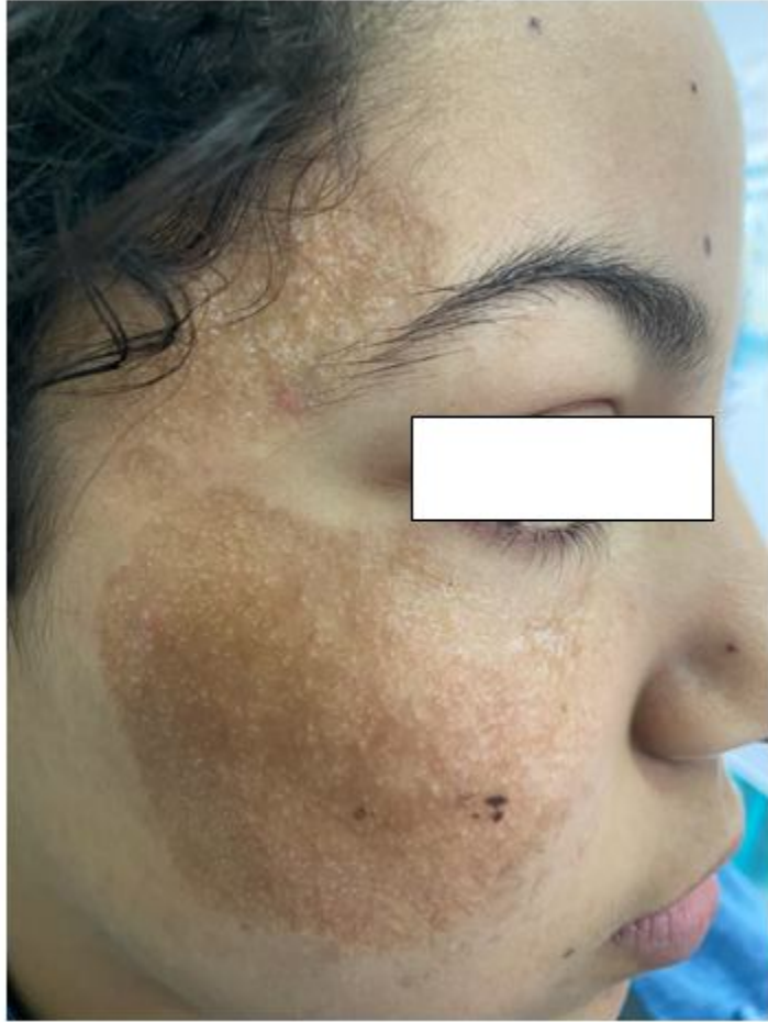
Figure 3a: Evolution of the lesions 6 months after the beginning of the treatment