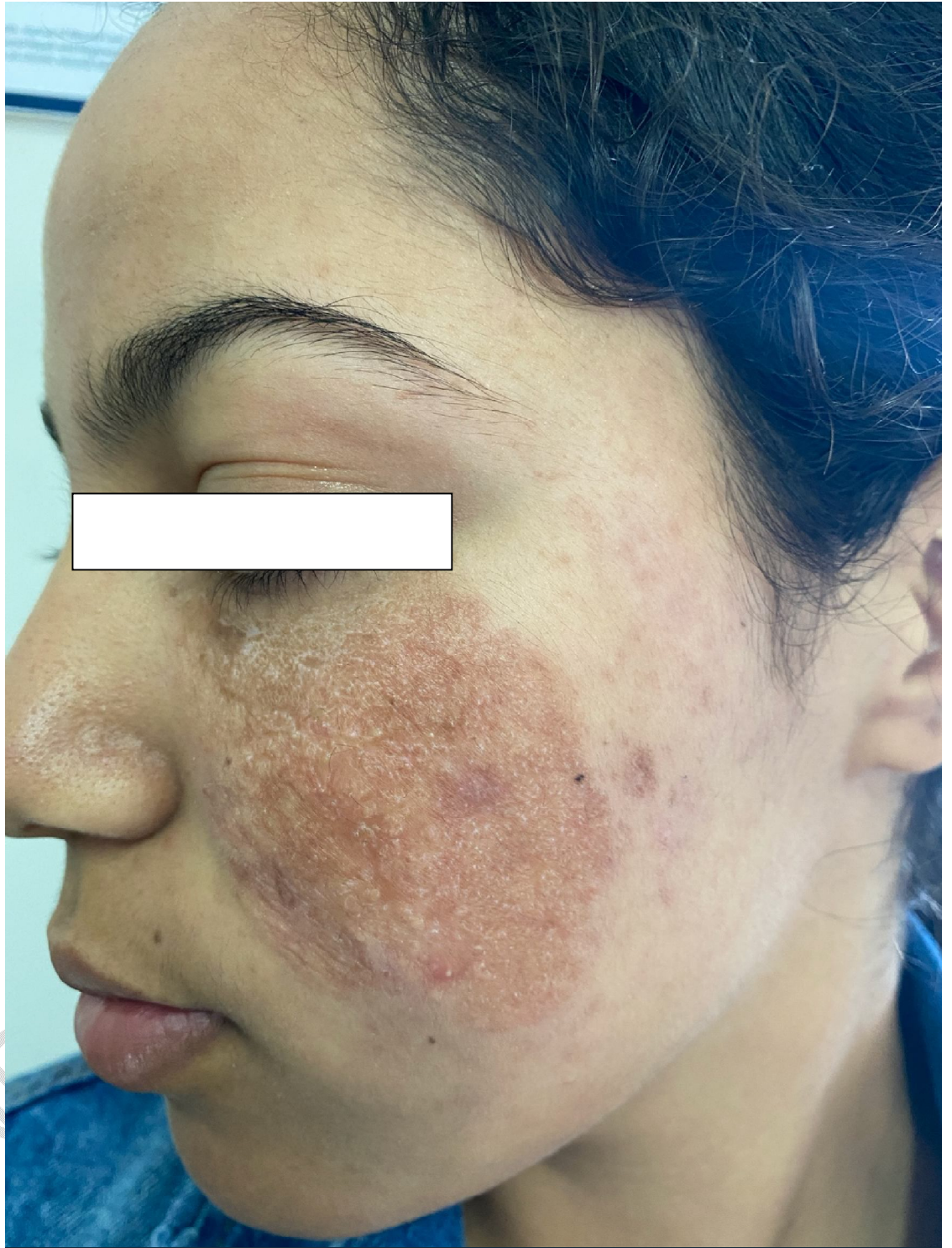
- Figure 3b : Evolution of the lesions 6 months after the beginning of the treatment