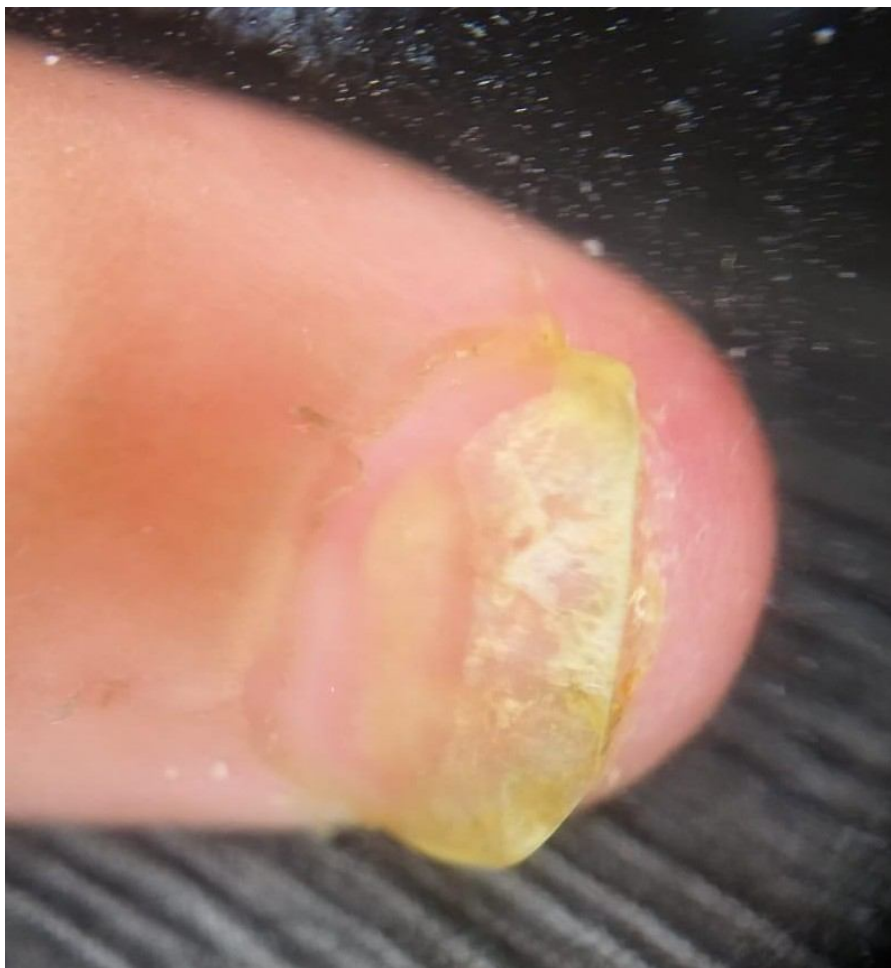
Figure 2: Dermoscopy showed yellowish chromonychia with longitudinal striae