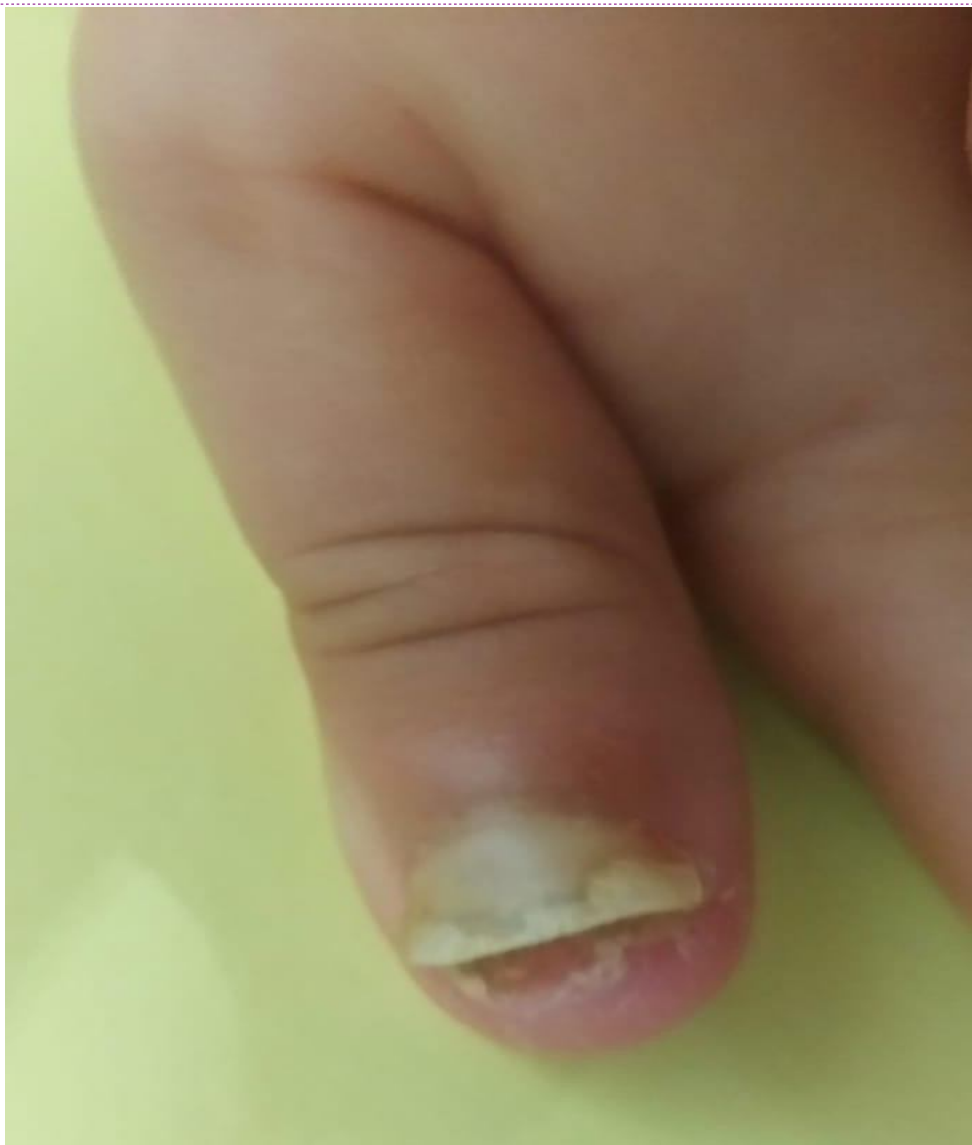
Figure 1 :xantho-pachyonychia of the thumbnail of the left hand reaching the latero-distal partwithsubungualhyperkeratosisandperonyxis

Comment [Dsp14]: All theTables& figures should be placed inside the text. Tables and figures should be presented as per their appearance in the text