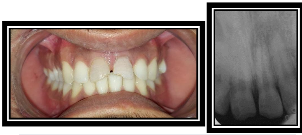
FIG.1 a. PREOPERATIVE IMAGE b. PREOPERATIVE RADIOGRAPH

A 16-year-old male, visit the Department of conservative dentistry and endodontics, with the chief complaint of fracture in his upper front teeth in the past 6 years. And given history of trauma at the age of 10 years. No medical history was reported. On clinical examination, Ellis class II fracture irt 21. Teeth were non-tender on percussion irt 21(Figure 1.a). On vitality examination, teeth were nonvital.