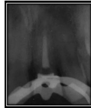
Fig 5 FOLLOW-UP AFTER 1 YEAR