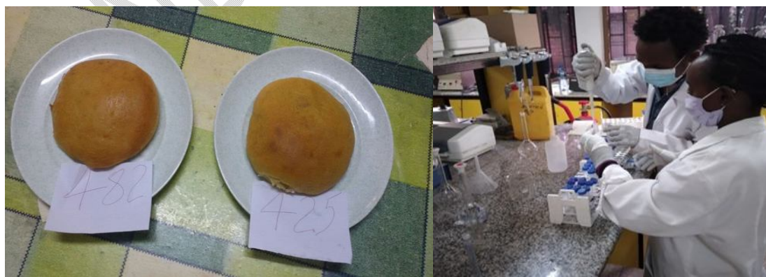
Figure 1 Bread baking and nutritional analysis

Bread baking was performed based on the method of Malik et al. , (2015) bread baking procedure (straight dough method). All ingredients flour (100 g blended), salt (2.5 g), water (65 ml), and yeast (2.5g) were added at the mixing stage and kneaded to obtain uniform dough. The dough samples were placed in baking pans smeared with vegetable oil and was covered for the dough to ferment resulting in gas production. The dough was then baked in an oven (Electric ovens SIMPLY 2T, China) at an average temperature of 230°C for 30 minutes. The baked loaf was carefully removed from the pans and allowed to cool and then packaged in Polyethylene bags for further analysis.