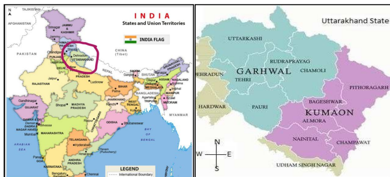
(Figure -1 showing study location)