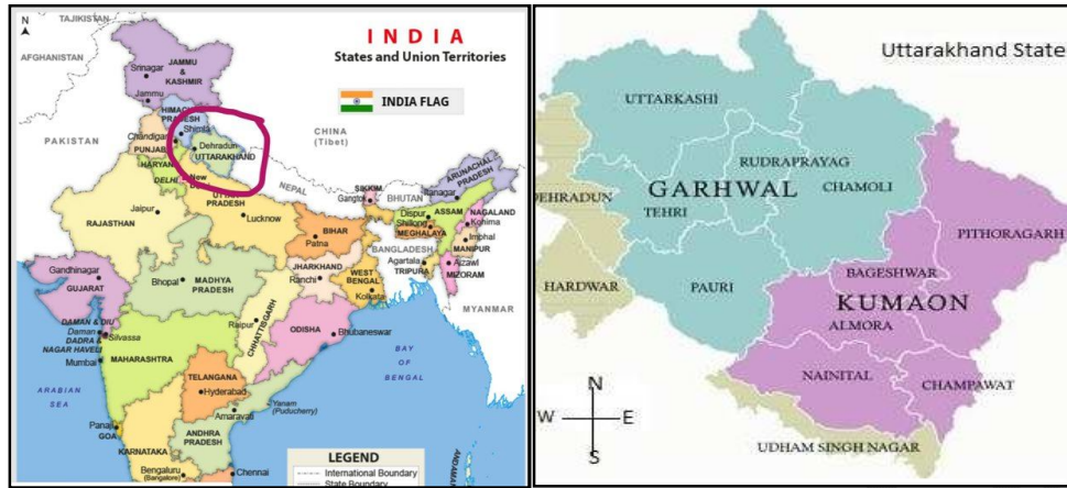
(Figure -1 showing study location)