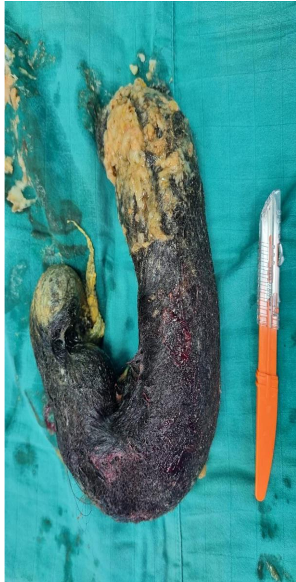
Fig. 2. Gastrotomy allowing manual extraction of the trichobezoar

"It may happen to both younger age groups and adults. However, both of these groups are usually associated with psychiatry illness and sometimes the former one related to congenital health problems. In younger age groups, psychiatry-related mood or anxiety disorders can be contributed to by background social history such as parenting or sometimes environment in school" [6].