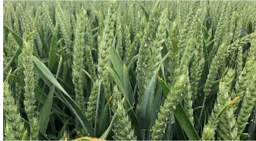
Fig 1 Experimental plot at grain filling stage.