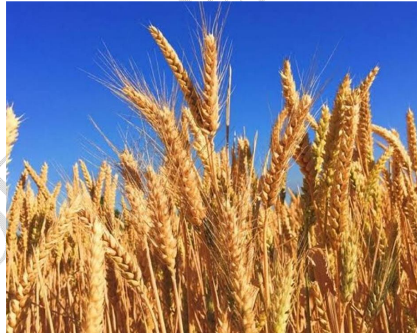
Fig 2 Panicle during harvest.