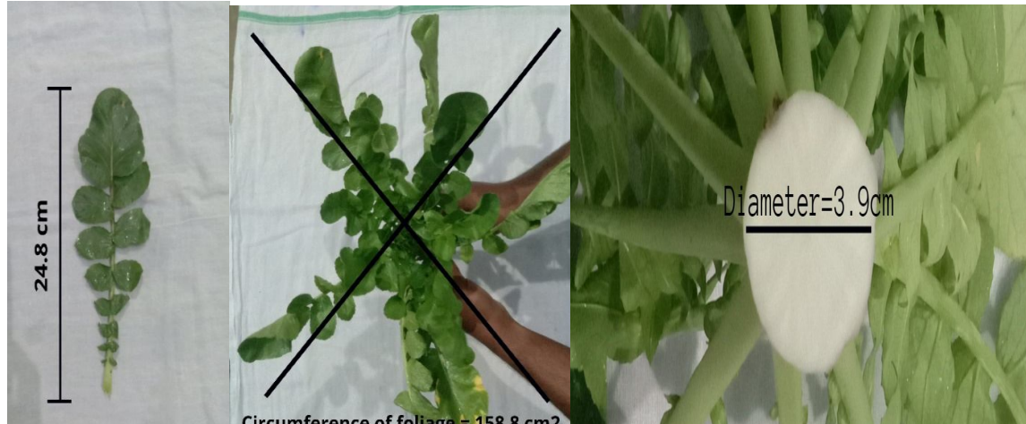
Fig 3: PHOTOS OF FERTIGATED (VERMICOMPOST+ BONEMEAL) PLANT.