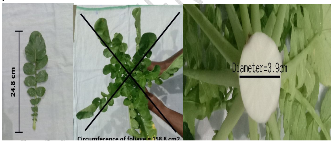
Fig. 2. PHOTOS OF THE CONTROL (NON FERTIGATED) PLANT