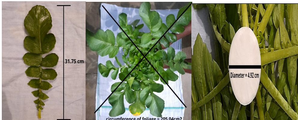
Fig. 3. PHOTOS OF FERTIGATED (VERMICOMPOST+ BONEMEAL) PLANT.

Comment [AM11]: Similar commentary expressed in Fig. 2.