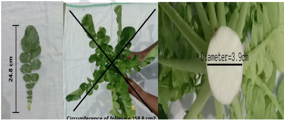
Fig. 2. PHOTOS OF THE CONTROL (NON FERTIGATED) PLANT

Comment [AM9]: Good!! You put illustrations.