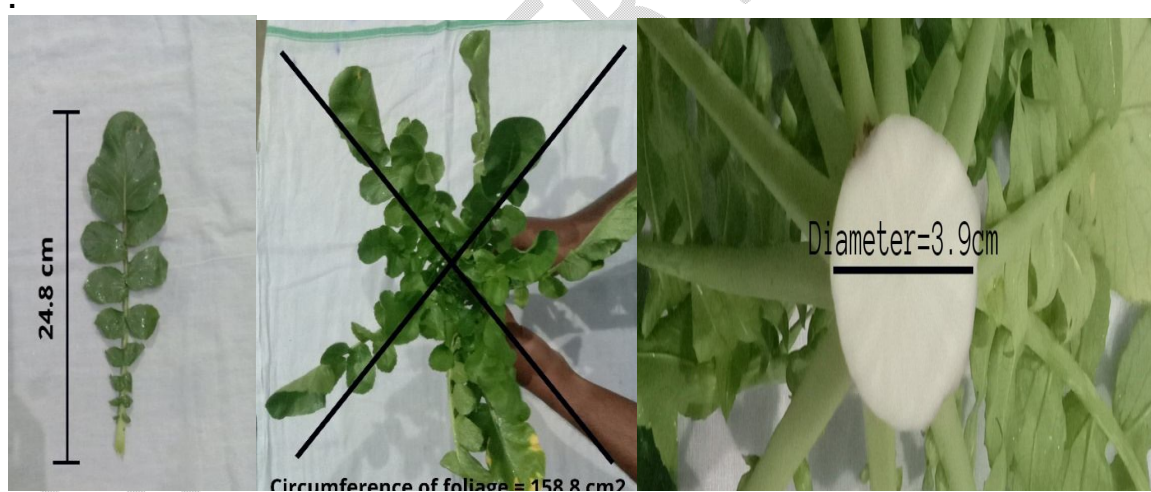
Fig. 2. PHOTOS OF THE CONTROL (NON FERTIGATED) PLANT