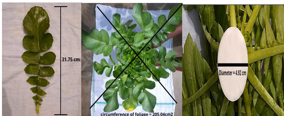
Fig. 3. PHOTOS OF FERTIGATED (VERMICOMPOST+ BONEMEAL) PLANT.