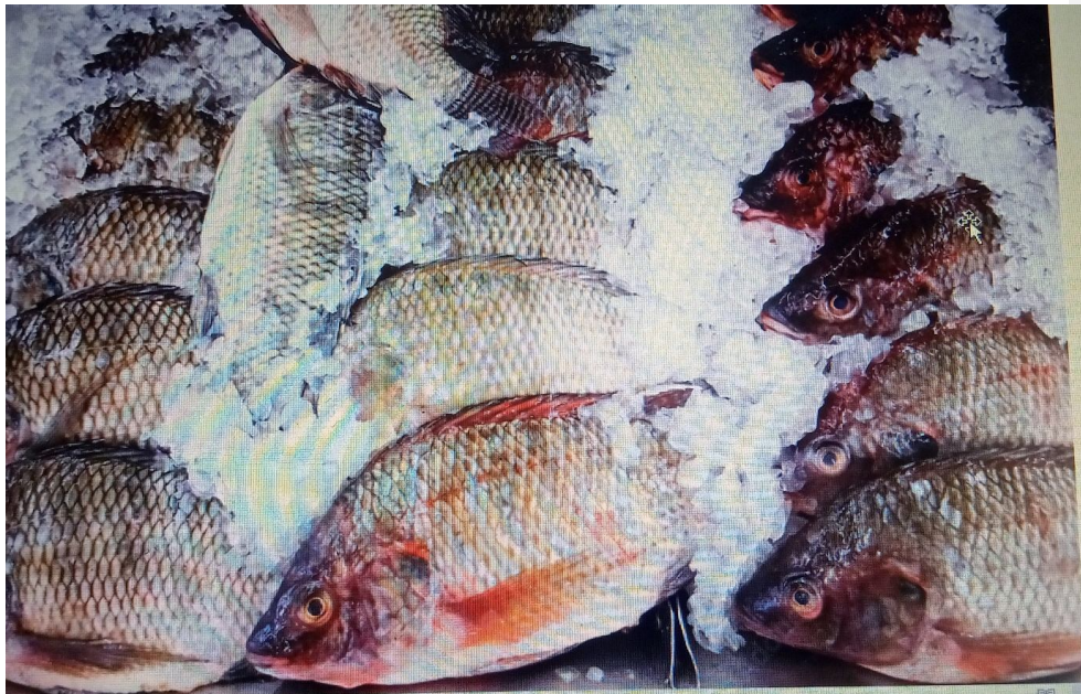
Figure 1 Chilling of Nile Tilapia ( Oreochromis niloticus ) using Clean ice.