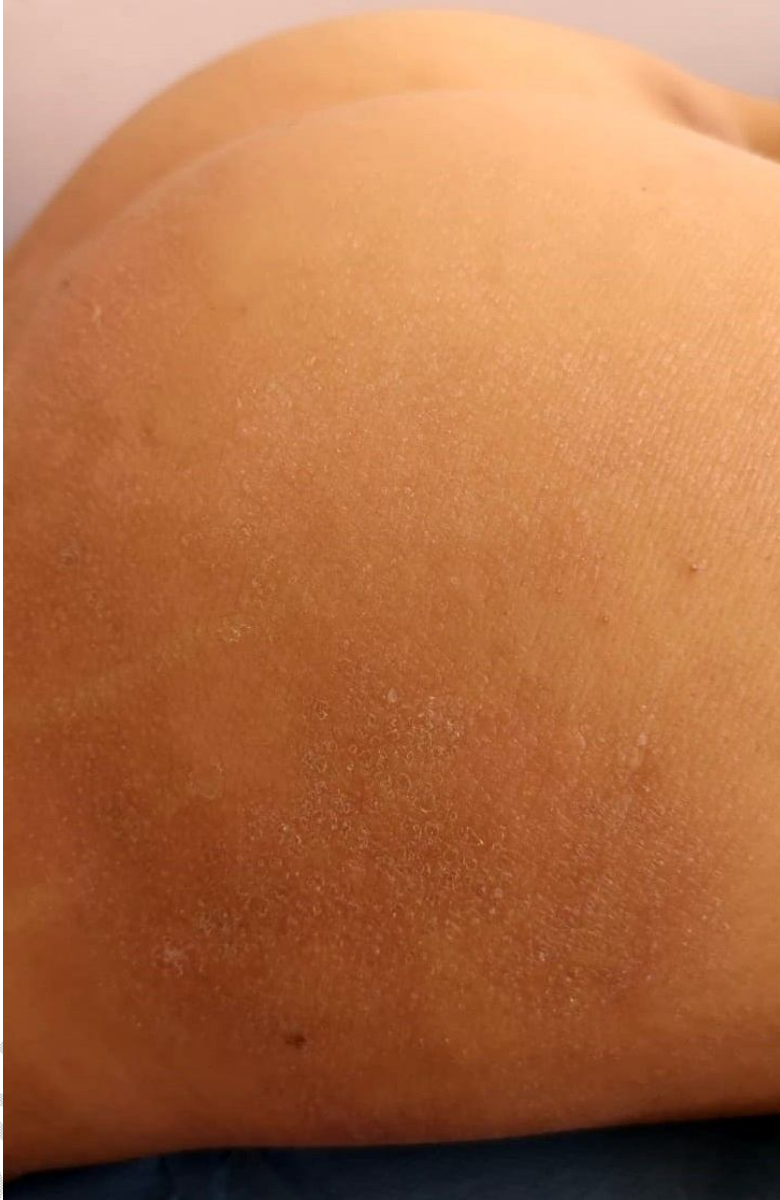
Figure 3 : Thinly scaly erythematous patches on the buttocks.