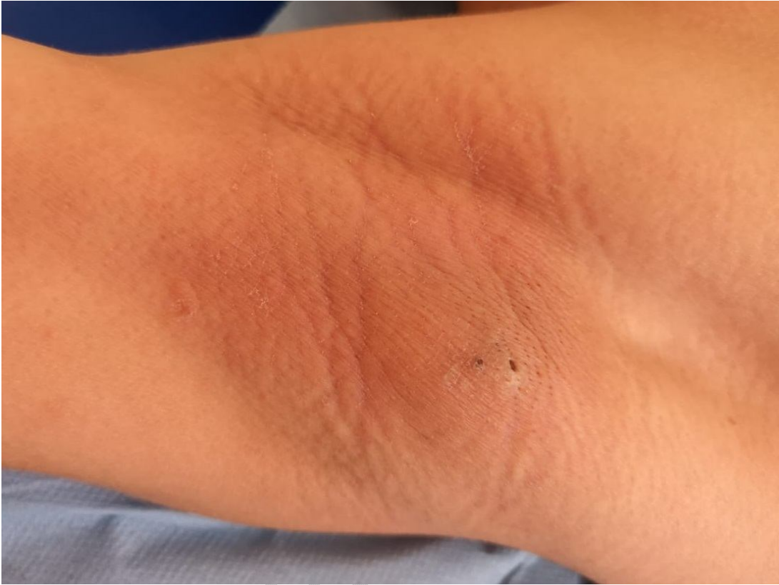
Figure 2: Thickened skin of the axillary fold with accentuated wrinkles, fine whitish scales and open comedones.