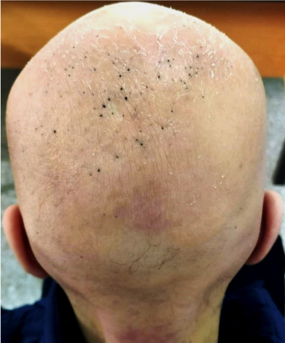
Figure 1 :Almost total alopecia of an infiltrated scalp with numerous open comedones and fine scales