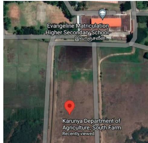
Map 1: Study area