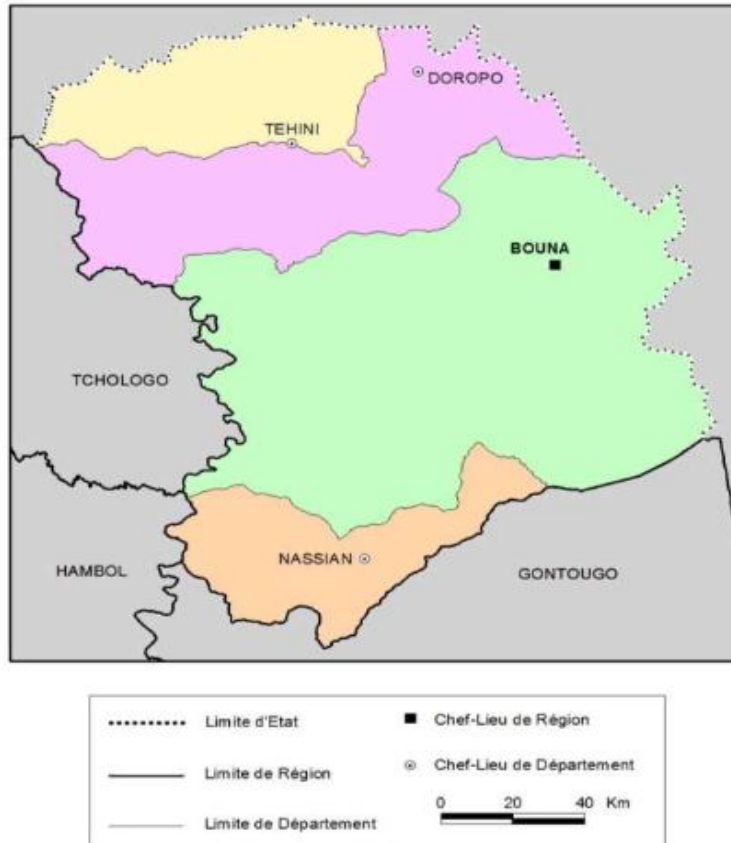
Figure 1: Map of study site

Located in a savannah zone dominated by grass and trees, the Boukani climate is Sudanese with two major seasons, one rainy from June to October (4 to 5 months) and the other dry from November to February (7 to 8 months). The main activity in the area is agriculture, which includes the cultivation of Kponan yams, for which the area is famous, cereals (corn, sorghum and millet), and more recently cashew farming. The Boukani is drained by the Comoé and the Volta Noir (Figure 2), which favors market gardening. Trade and transportation are not forgotten. The area is also known for its mineral-rich subsoil, particularly gold, which is mined by illegal miners. Livestock farming is an important part of this economy, with poultry, cattle and goat breeding. The Tourism, in particular the Comoé National Park founded in 1968, is also a source of foreign currency. With its surface area