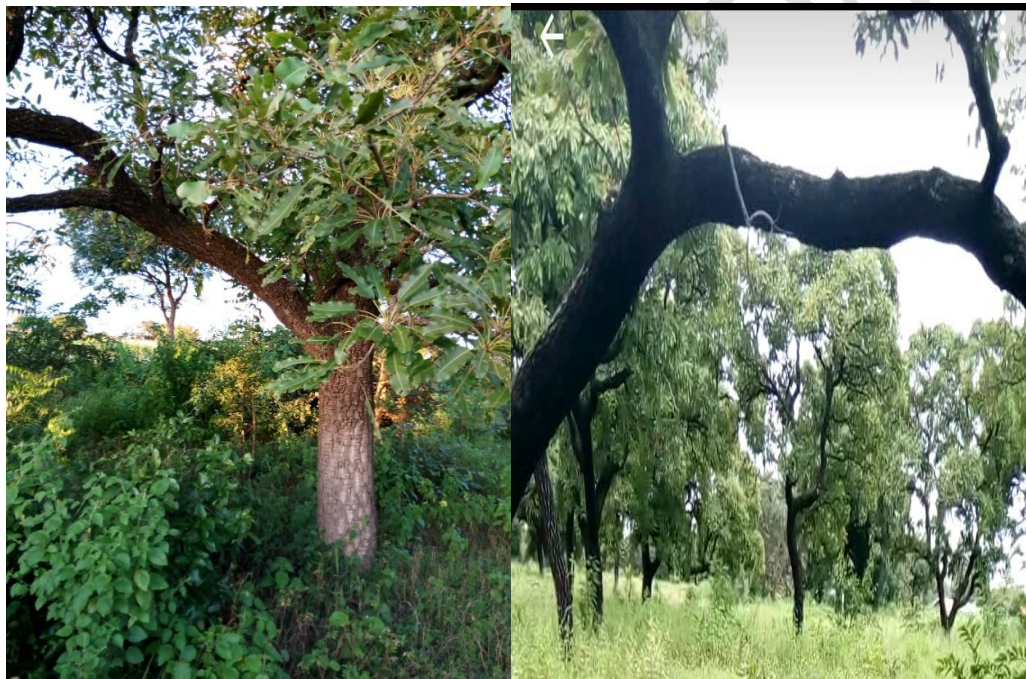
Figure 2: Shea woods and park

The shea parks are close to the villages. The trees were expressly abandoned in view of their importance. These parks offer more or less homogeneous seedlings according to the average age of the plants and their spatial distribution (Figure 2). The harvest rate is far from 100%, given the number of seeds germinating under the trees. The parks cover important areas, but in constant reduction. Most of them are located on the edge of a gallery forest and cohabit with other woody or hardy and herbaceous species. The soils are strewn with ferruginous laterites.