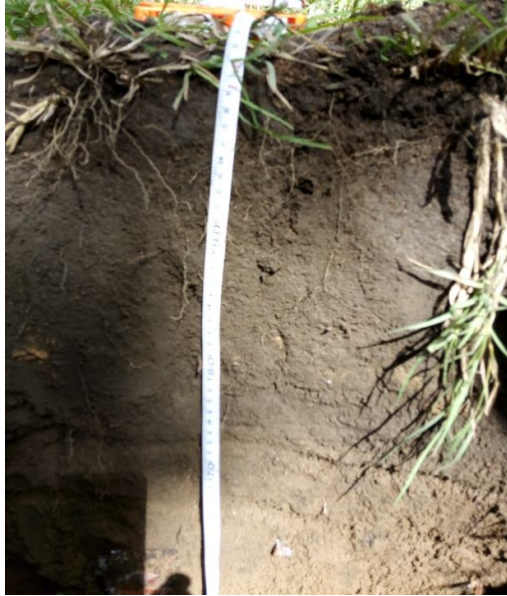
Figure 6 : Soil pit with three horizon