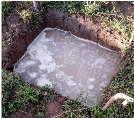
Figure 7 : Soil pit with one horizons

The third pit at Doropo (Nakélé) with geographical coordinates, presented a single horizon, with an induration level located at less than 30 cm depth, as well as the low level of the water table. This horizon is sandy with a high proportion of fine sand. The soil is shallow and gravelly at depth. Such soils are more favorable to hardy woody species and plants with fasciculated roots (Figure 7). The soil is a fluvisol.