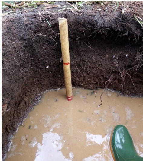
Figure 5 : Soil pit with two horizons

3/1, it is humid and humusy. The structure is polyhedral. A strong biological activity exists by numerous roots of diameter going from millimeter to centimeter with a subhorizontal orientation. The soil is not coherent and is very porous with pores of millimeter diameter. The high coarse element load seems to be the major constraint. The horizon is of type A11. The second horizon is about 30 cm thick and lies on the induration with a high load of coarse elements. Its color is ochre 5YR 4/6, with low biological activity (Figure 4). The horizon is very moist and humus-like with a silty-sandy texture and less than 5 percent clay. The coarse elements are made up of 85 p.c. of large rounded quartz of centimetric to decimetric size and 15 p.c. of nodules. The structure is polyhedral and the soil is not coherent but very porous with centimetric diameters. Roots are few in number with a subhorizontal orientation of millimeter and centimeter diameters. The constraint is a high coarse element load, induration, and a slickness at 60 cm (Figure 5). The horizon is of type A12. The soil is a plinthic leptosol.