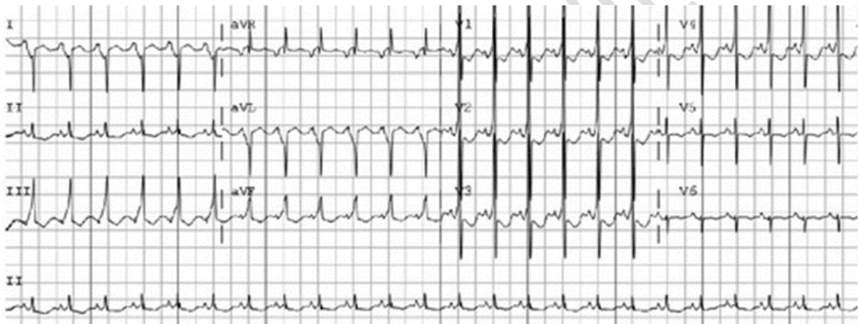
Figure 1: Patient ECG

The electrocardiogram showed a sinus tachycardia of 150 bpm with negative T waves in inferior and anterior derivations (figure 1). A bedside echocardiography showed an impaired left and right ventricular function, LVFE was at 30%, slightly elevated left ventricular filling pressure, moderate mitral regurgitation (figure 2), mild tricuspid regurgitation.